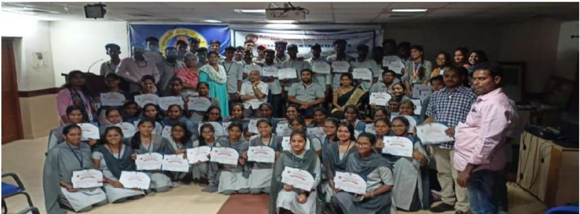
Group photo of the students along with the team on 16-07-2022