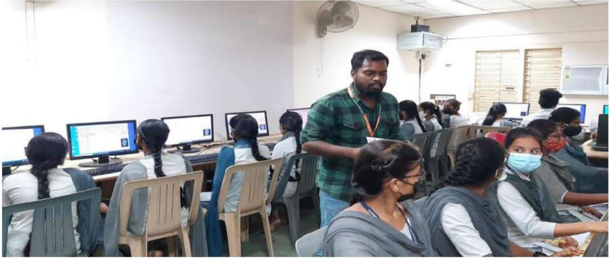
15-07-2022, Students participated in the workshop

(Affiliated to Andhra University, Accredited by NAAC with B++ Grade)